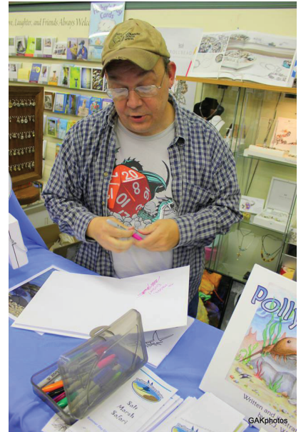
Signing copies of Polly at a book signing event at Forney's Too in Dover