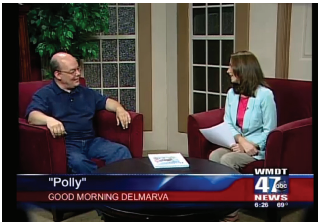
Talking about Polly on Good Morning Delmarva